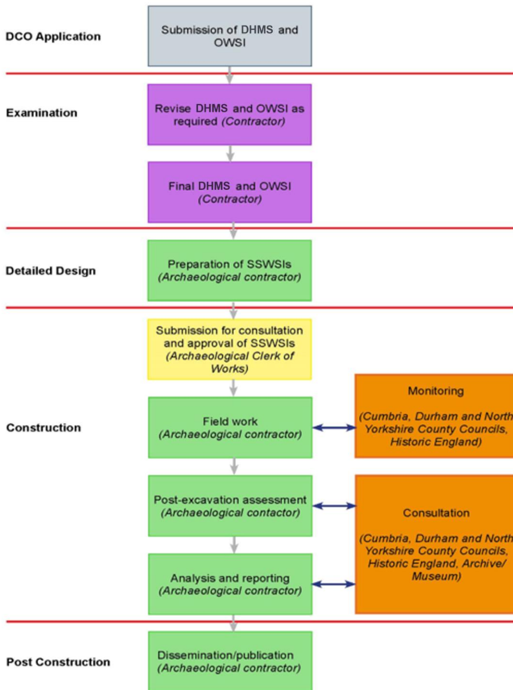
Figure 2: Process for development and implementation of the DHMS